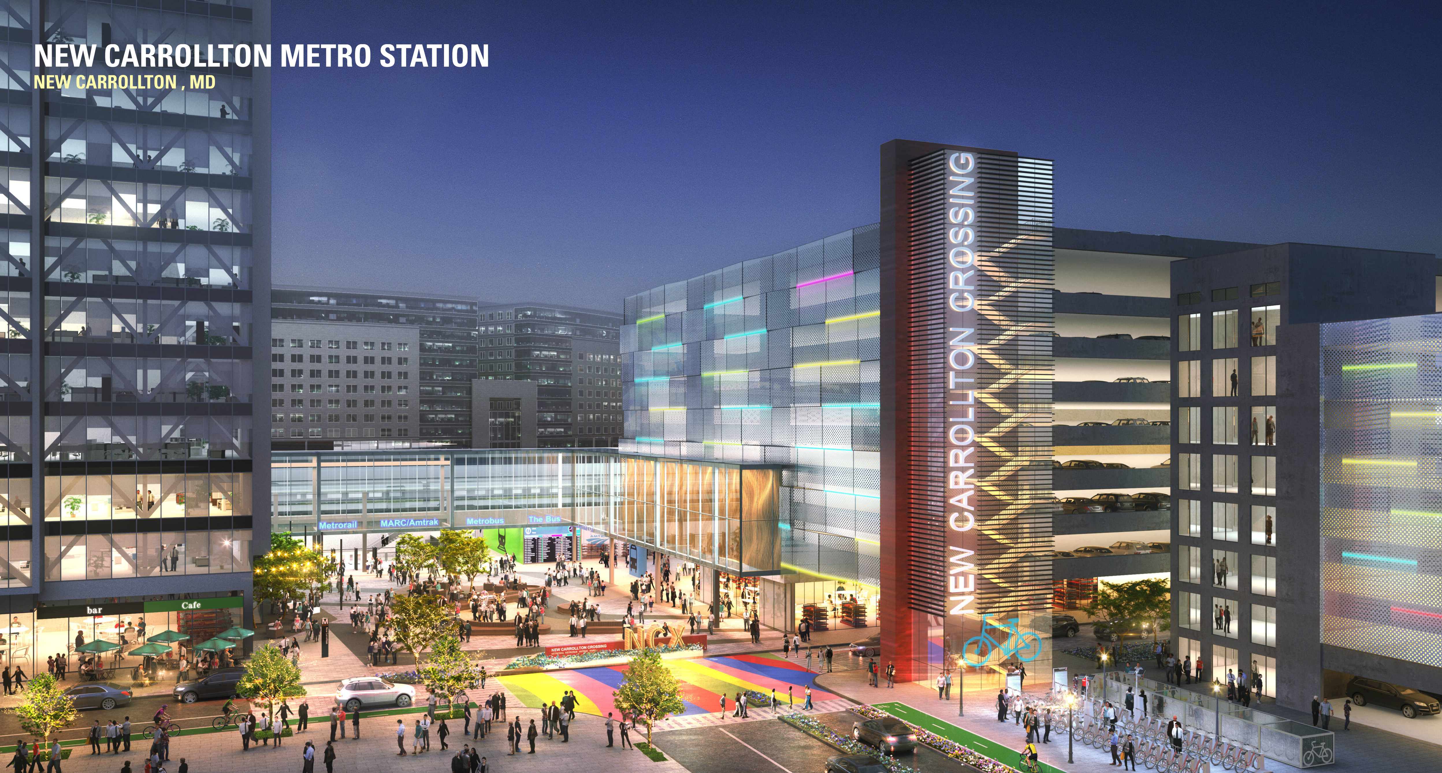
New Carrollton Metro Station