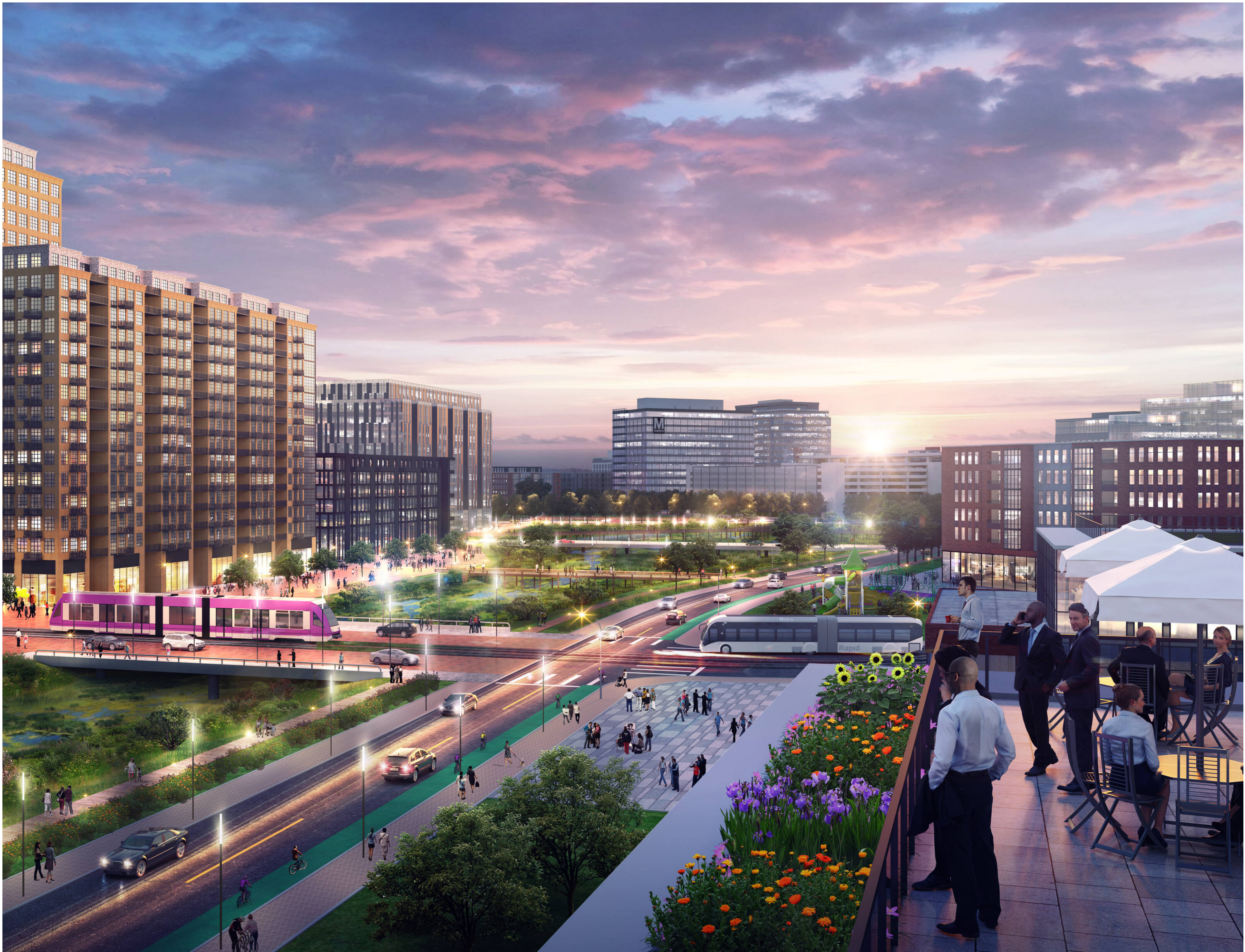
New Carrollton Metro Station