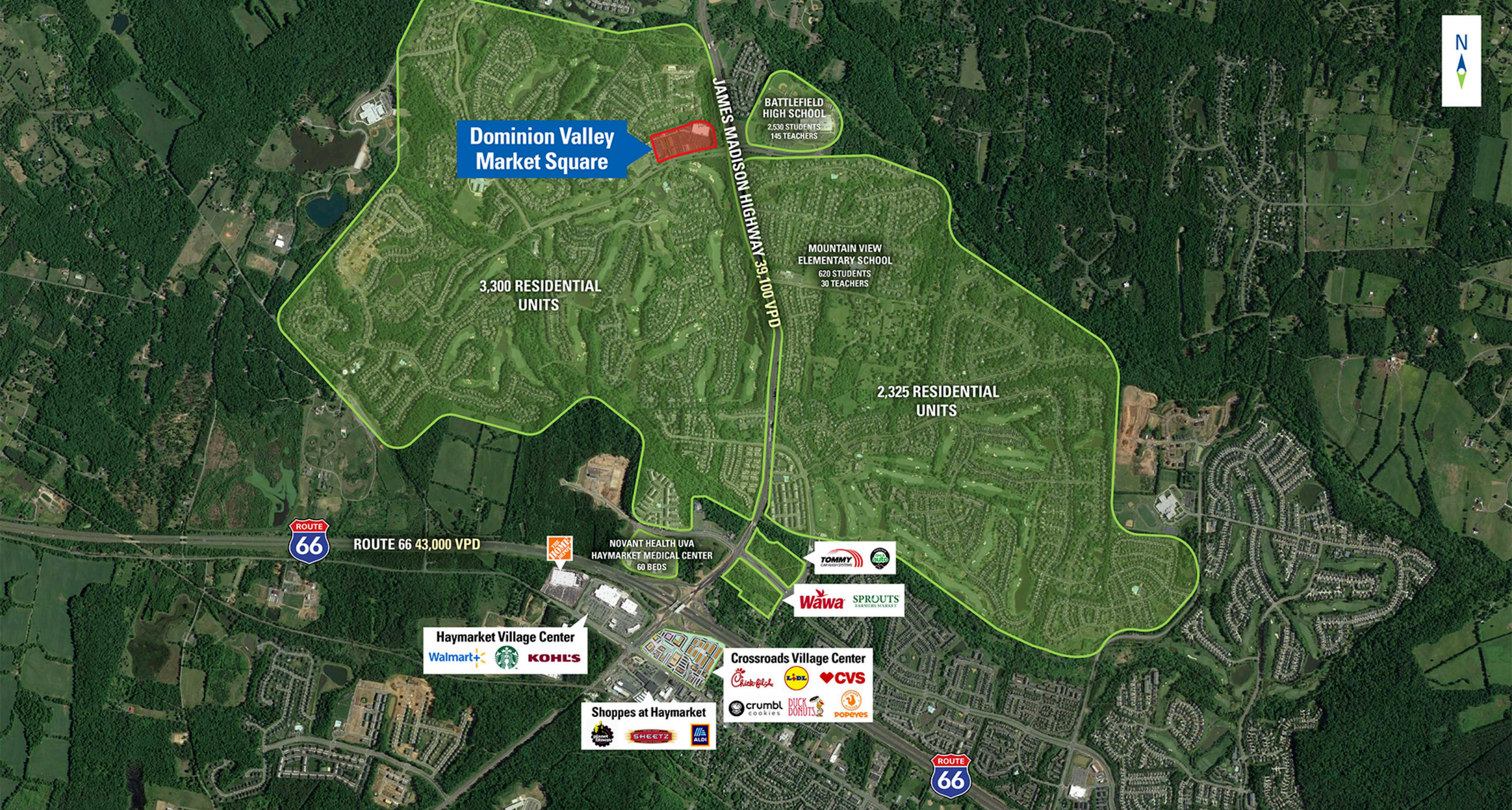
Dominion Valley Market Square Pad Site