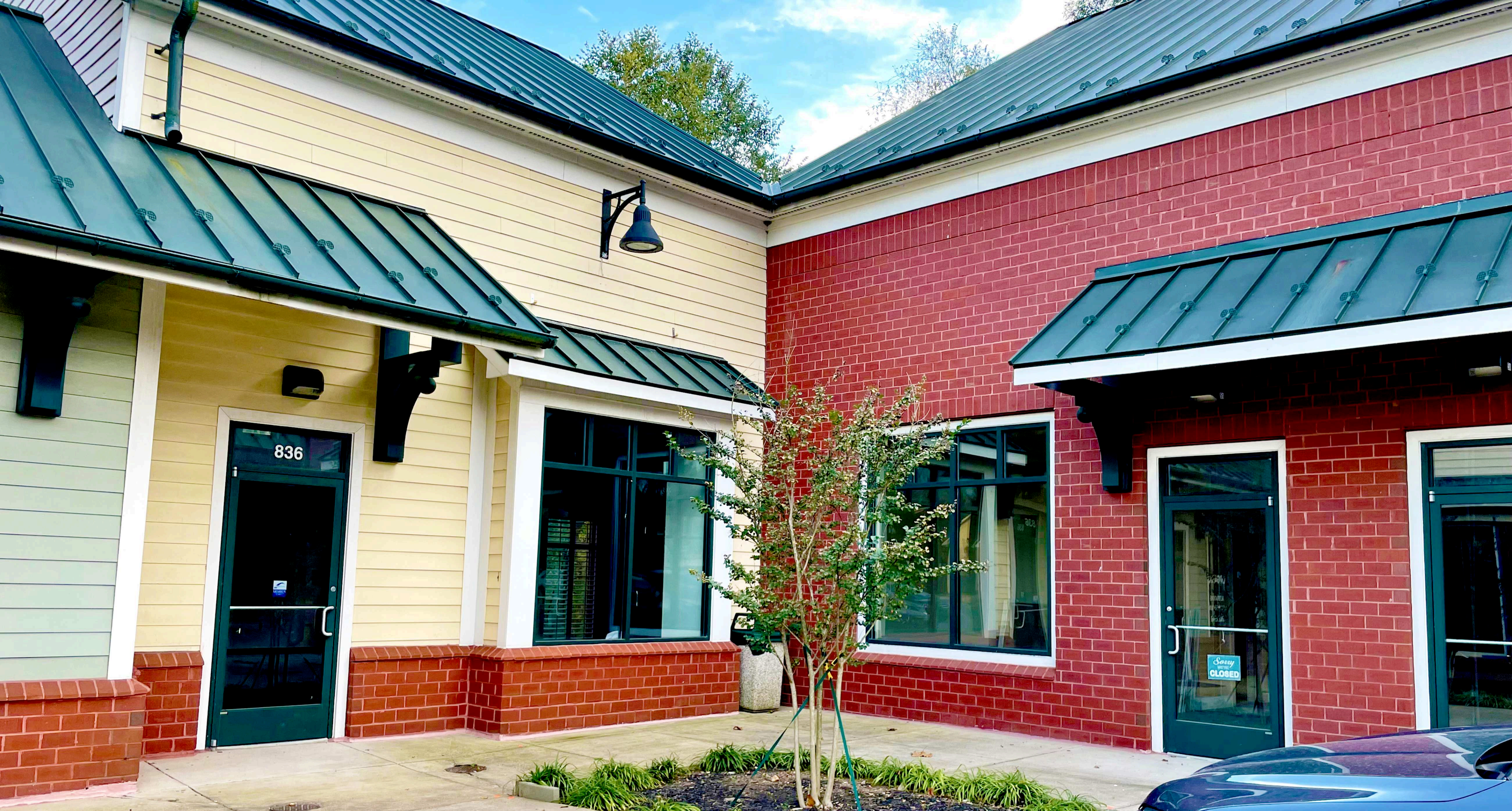
South King Street Center