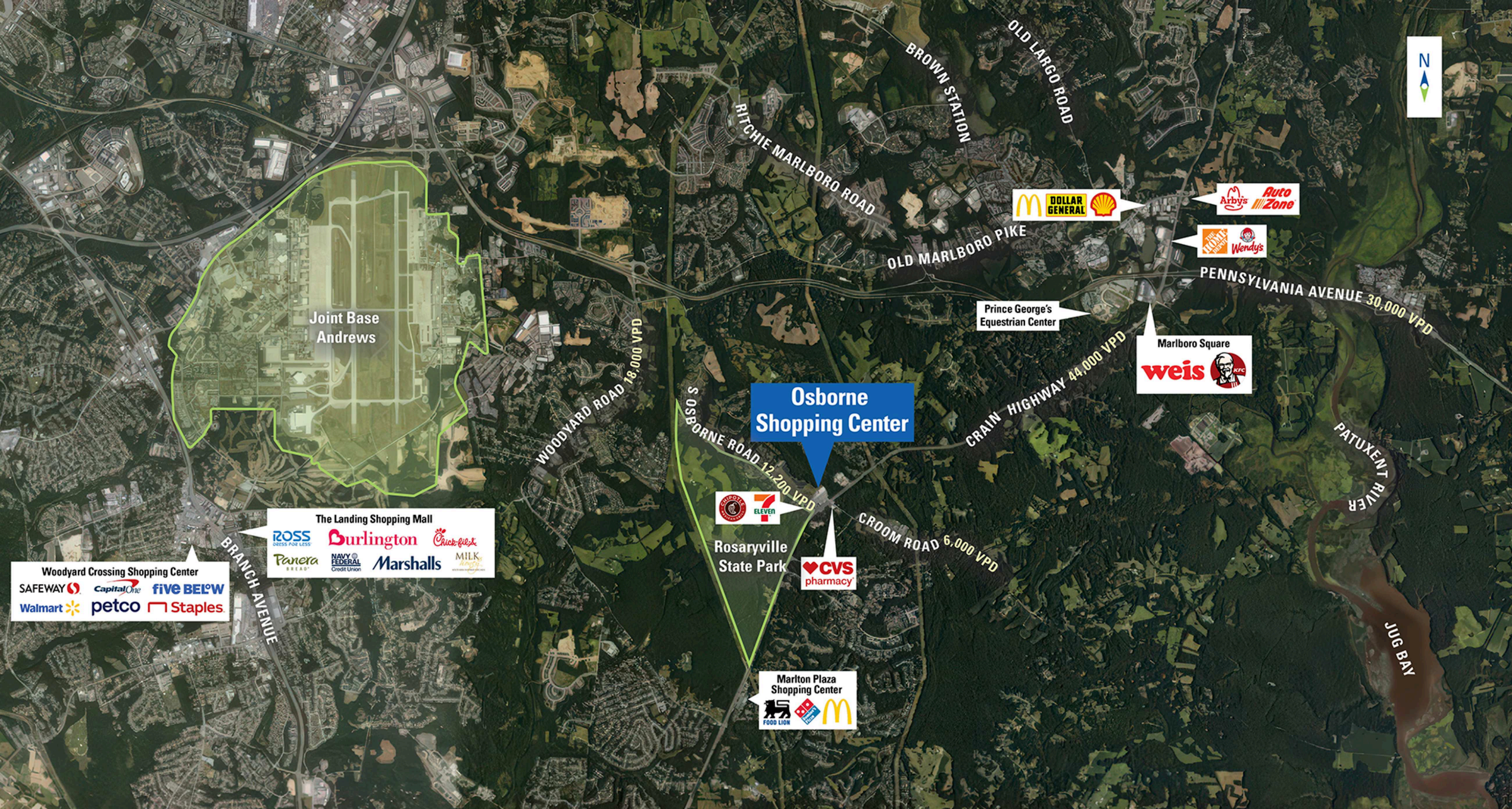
Osborne Shopping Center