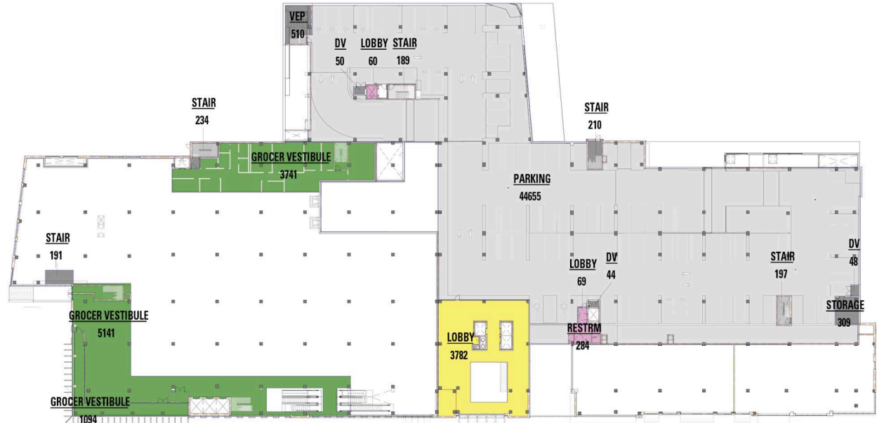
P2 - PARKING SCALE 1" = 40'-0"