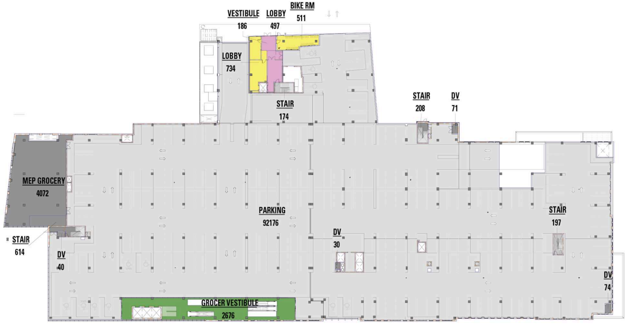
LEVEL 03 - P3 Exclusive Whole Foods Parking SCALE 1" = 40'-0"