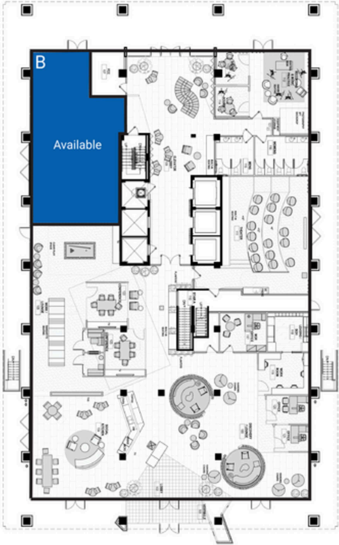
BUILDING 2 SUITE B - 1,473 SF