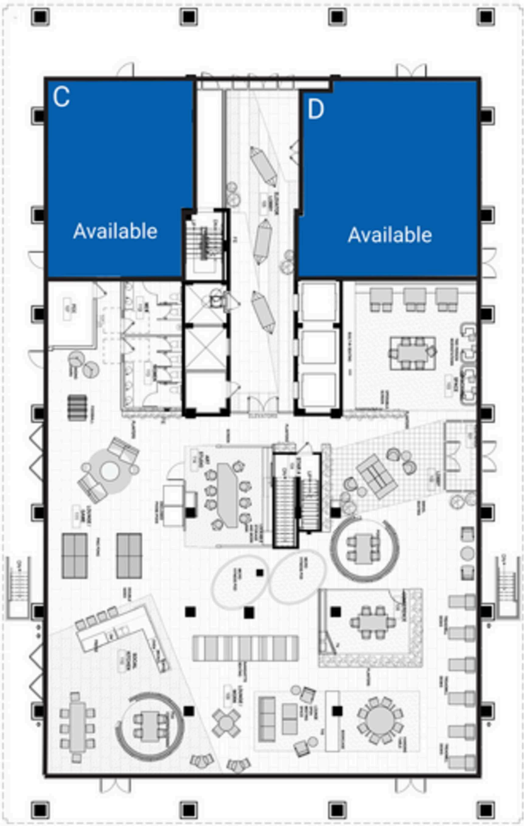
BUILDING 3 SUITE C - 1,213 SF SUITE D - 1,493 SF