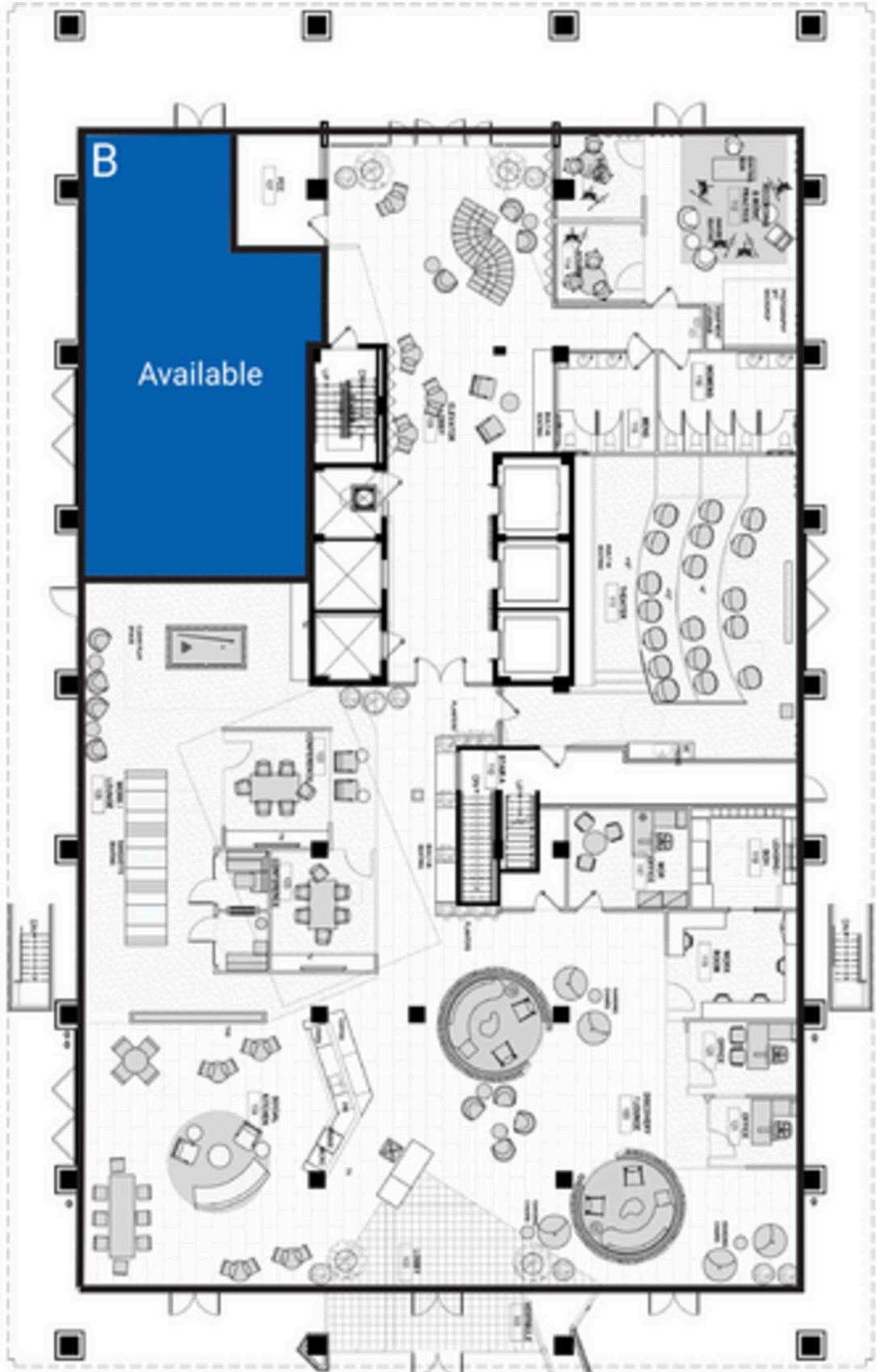
BUILDING 2 SUITE B - 1,473 SF