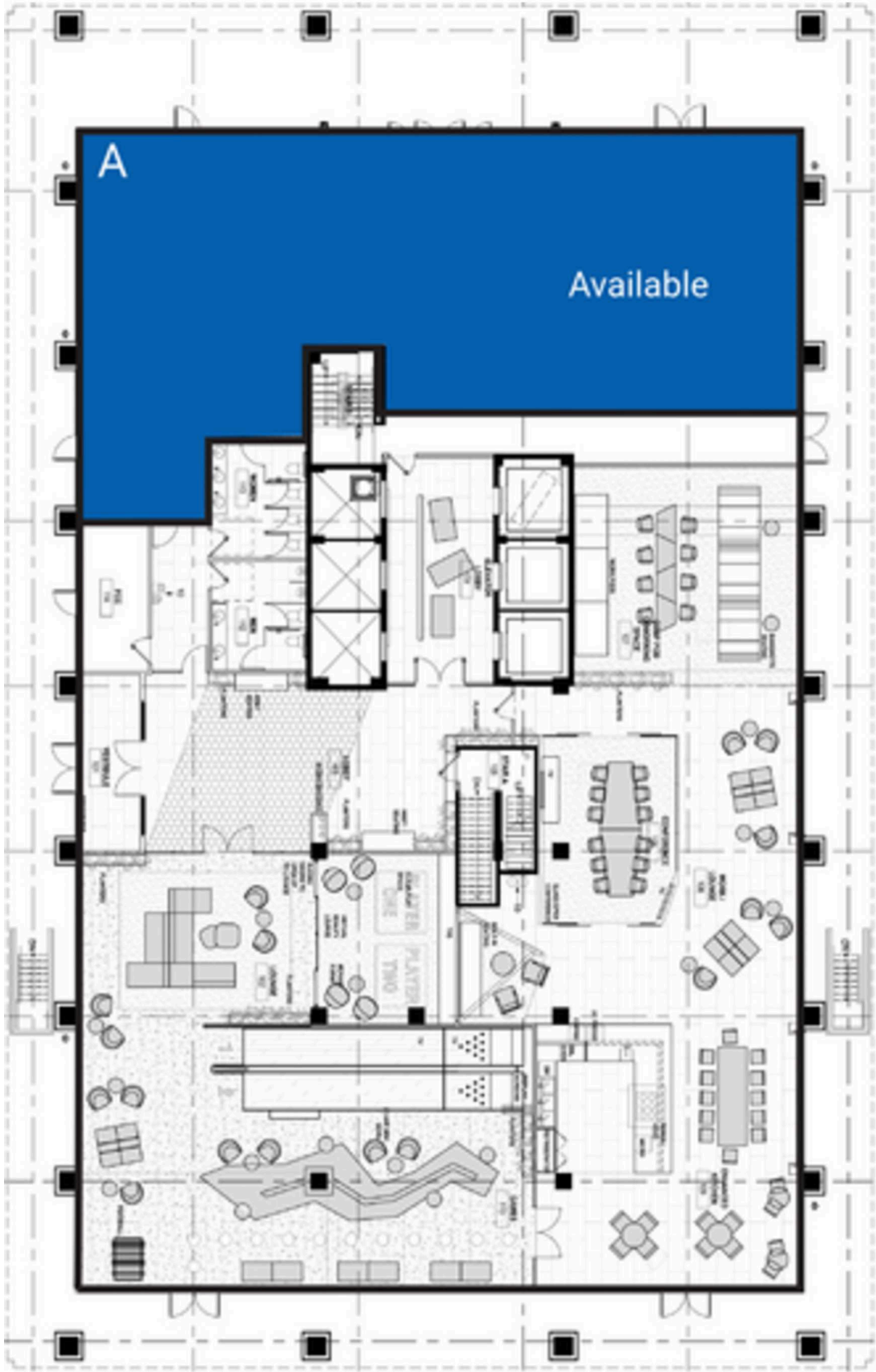
BUILDING 1 SUITE A - 3,190 SF (VENTED)