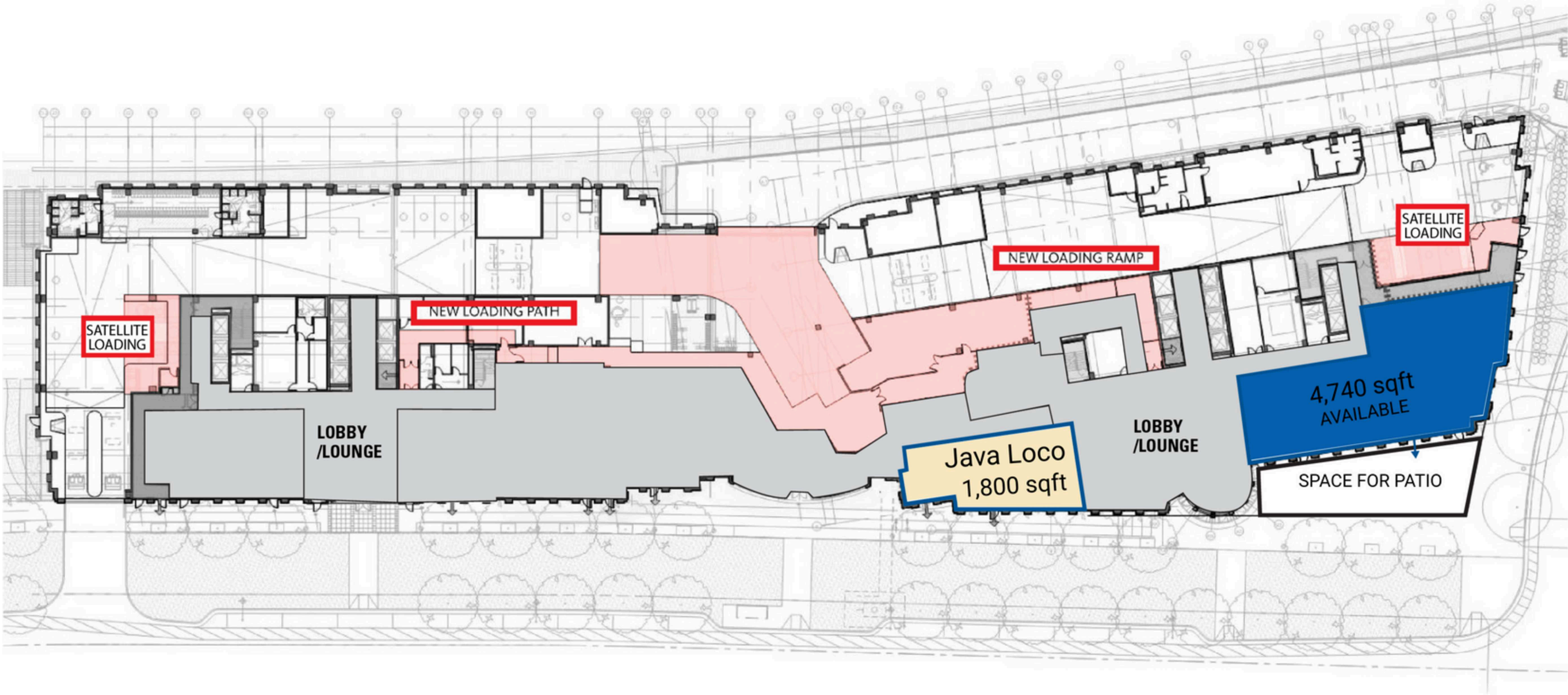
NORTH & SOUTH BUILDINGS ONE & TWO POTOMAC YARD