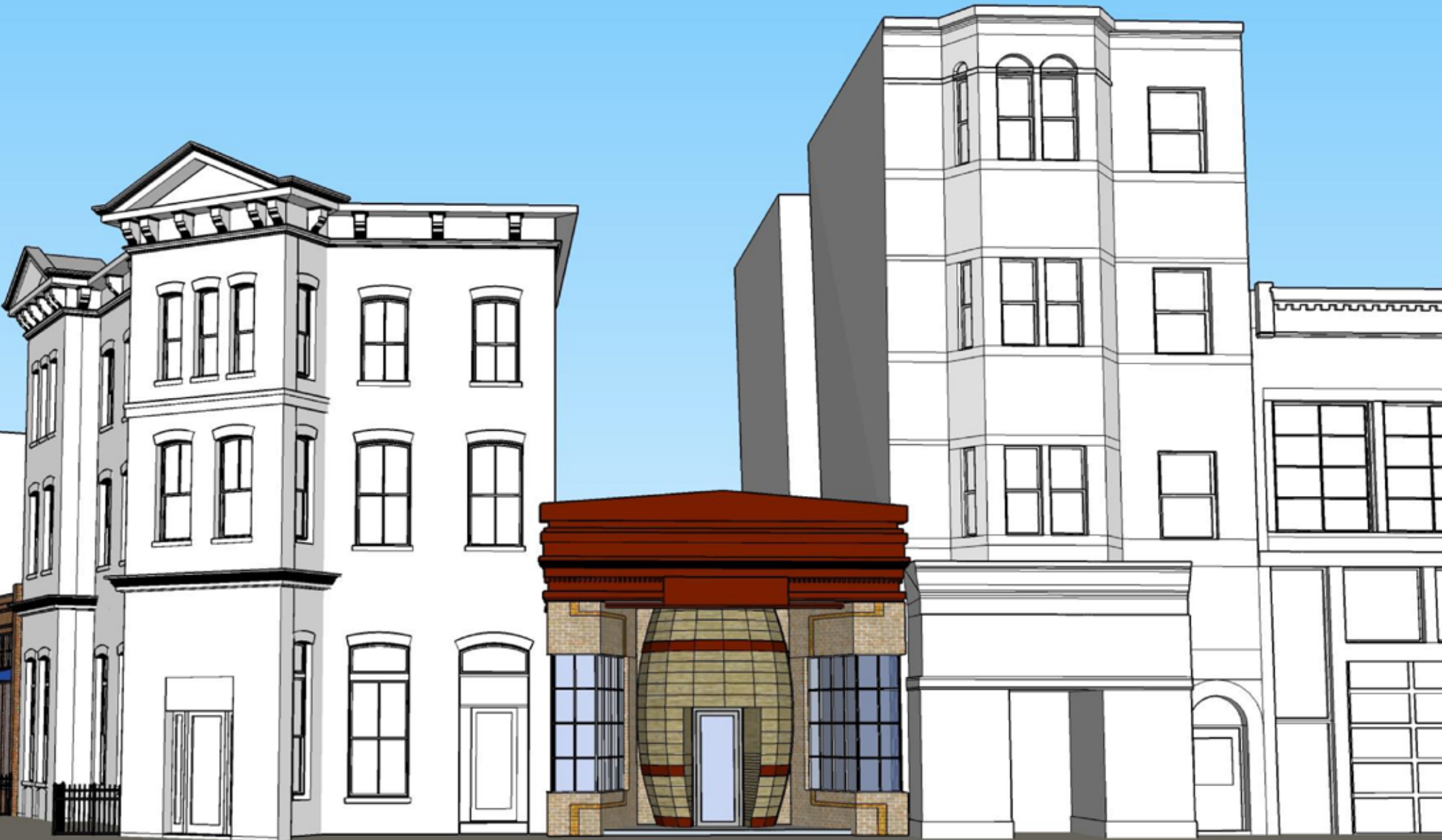
EXISTING 14TH STREET STOREFRONT